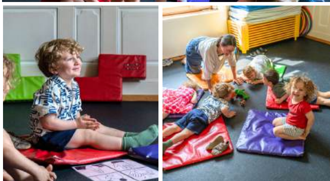
Children of all ages in Early Years get to explore Expressive Arts & Design.