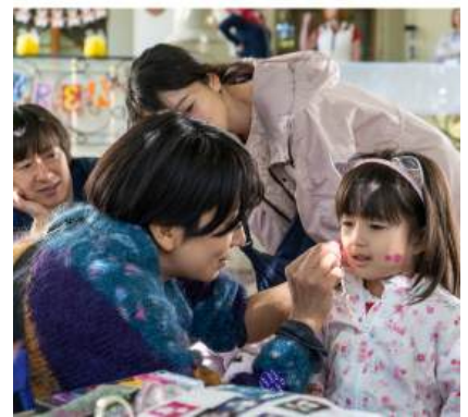
Families enjoying our recent Open Morning and Art Event.