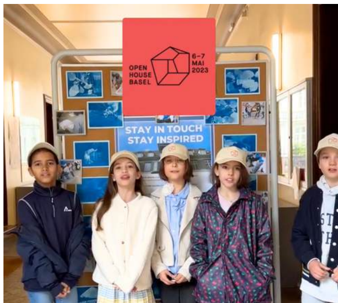
Some of the ELA Basel student tour guides leading the way.

The event provided a valuable opportunity to highlight the role of Wildensteinerhof not only as a place of learning but also as a community landmark. Visitors were able to appreciate how adaptive reuse of historic buildings can serve contemporary needs without compromising heritage, creating inspiring spaces that foster both education and cultural continuity.