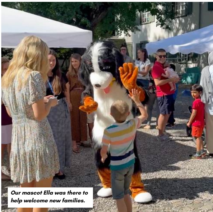
Our mascot Ella was there to help welcome new families.

As the school year approaches, this event marked the beginning of many positive experiences for both new and returning families alike.