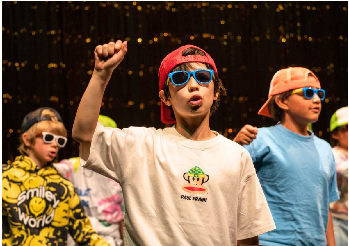
Students from Year 4 shine during their 'School-O-Vision' Scala performance.