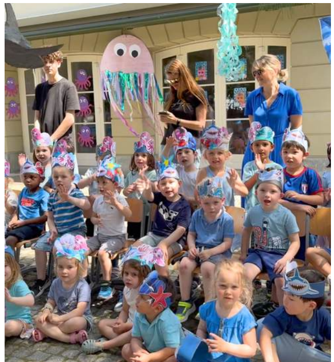
Top: Preschool graduates of 2025 and (below) Poseidon and his friendly octopus who presented the certificates.

While graduation marked the end of preschool, it also heralded the start of new opportunities. Many of the graduates will continue their educational journey within ELA Basel